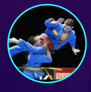
VOVINAM VIET VO DAO